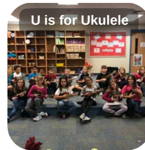
U is for Ukulele