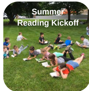
Summer Reading Kickoff